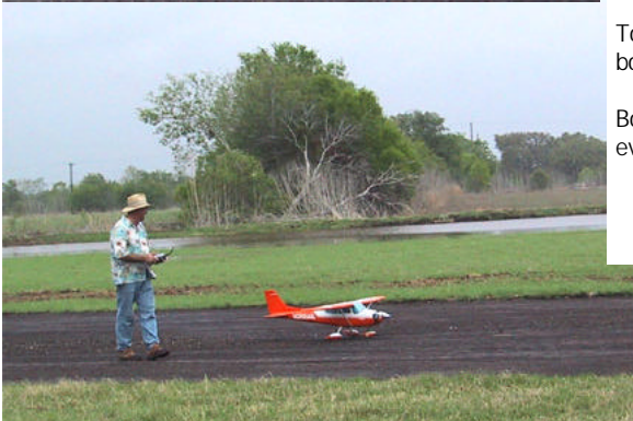
Top left, the plane bounces.