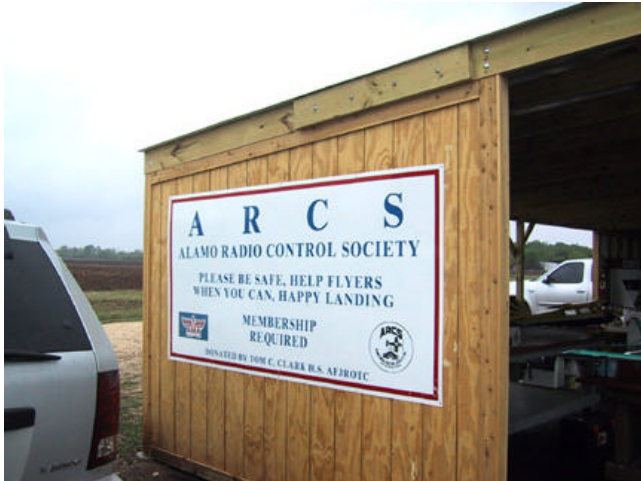
In case you can't read it, our sign says: "Please be safe, Help flyers when you can, Happy Landing."

The March fun-fly was delayed a week because of Easter. That was a blessing because the weather, though not great, was a bit better. The day started out with intermittent showers but got better as the day progressed. Turnout was better than expected and most of us got in quite a few flights in spite of the weather. Roy Ehlers cooked us up a bunch of hot dogs to munch on between showers. Rex O'Connor got in a couple of flights after about a dozen year layoff—nice to have you back Rex. We had about the usual number of mishaps; however, one was quite Unusual as you'll see in the pictures. The new field turned out really great. All that remains now is the paving. Once again, our heartfelt thanks to everyone who devoted so much time and effort to make the new field a reality. The old field is CLOSED.