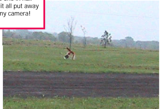
Running on only one cylinder during the takeoff run, shouts of "abort, abort", were heard but not heeded.