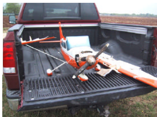
Bottom left: The gory evidence.