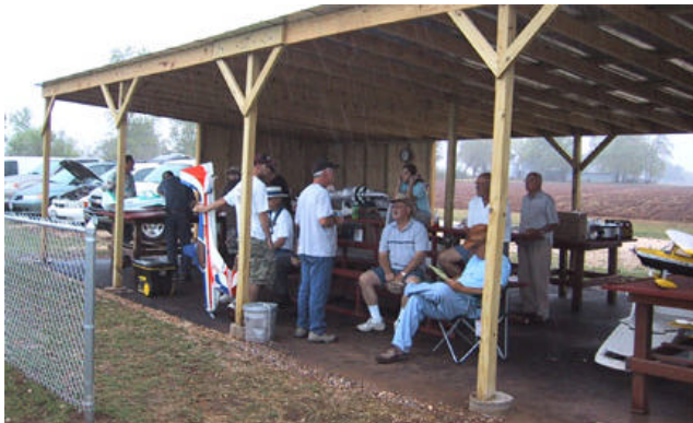
Above and right: Taking a break during on of the morning showers. Plenty of room under the shelter.