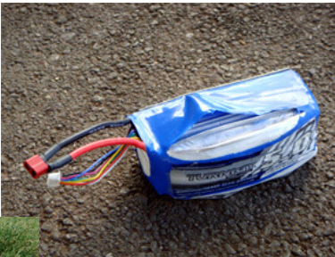
Pete Dubree "over-amped" a six cell pack. Outer wrapper burst (left). Pete decided to "neutralize" the pack by puncturing it with a long screwdriver. Smoke and fire started immediately. Lots and lots of very acrid smoke and fire. Not sure I'd try that. Battery later safe to transport for disposal.