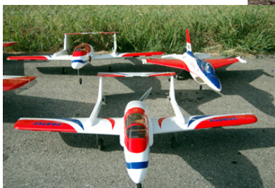
Above: Pete's fleet. It was one of these that "over-amped"