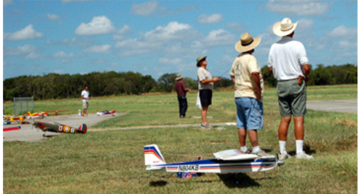
The flight-line got kinda busy from time to time.

Also, if you note the options in the left pane, you can start a "View Slide Show (Full Screen)." Try it, you will surely like it!