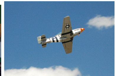
Below: Tim applied the Reactor decal inverted just so that we can read it when he flies! (See inset)