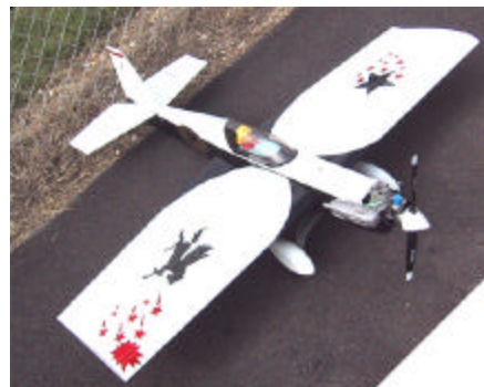
I couldn't take a picture of myself so I thought why not show off my airplanes at least?

Nobody asked me, but: The only crashes I've witnessed that were blamed on Spektrum radio failures were all (I think) gassers. I didn't see the radio installation(s) prior to the crashes. I wonder if maybe the transmitter signals were blocked or otherwise affected by the large engine or other close-by metal/electrical components?