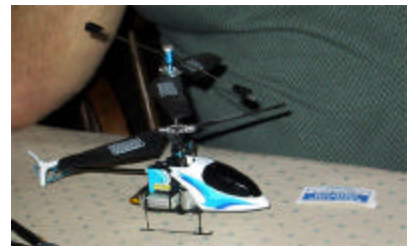
Left: Compare it's size to the raffle ticket next to it...