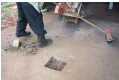
The repair process: Cut out the damaged area with a power saw. Use a pick to remove all damaged material down to the bare earth. Fill the hole with fresh asphalt, compact and smooth.

Did we get the wrong stuff? NO! The contractor explained to me that it may take six months for the asphalt to FULLY settle and cure and as much as a YEAR for enough dirt/dust to blow onto it and fill all of the little crevices and pack in. It will get better over time.