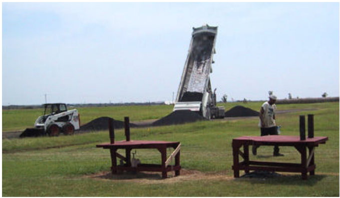
It took some mighty big trucks... some smaller machines... and lots of back breaking sweat.