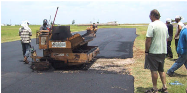
The last section being put down.....