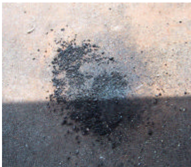
Right the damaged area. Black oatmeal mush almost completely through to the ground.

WHY THE BIG DEAL ABOUT FUEL SPILLS? I sent you this via email but here it is again, in pictures: