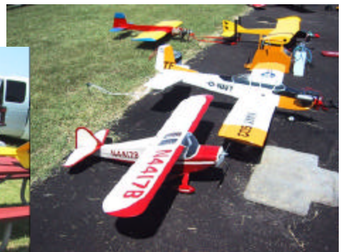
Hmmm, I think I've seen these two somewhere at least once before!