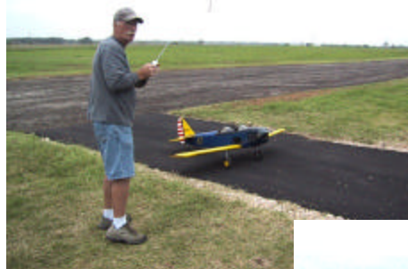
Phil taxis back after yeat an- other flight.